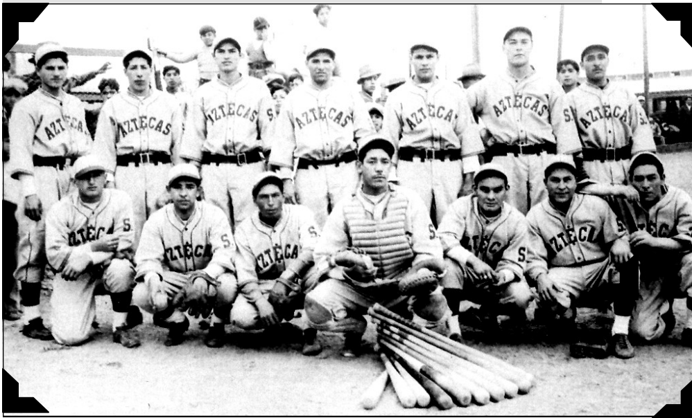
The Santa Paula Aztecas, above, in 1933, were a powerhouse team.